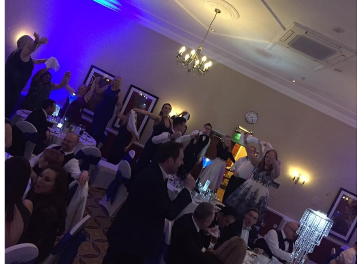
The Headway Sapphire Ball was held in the Broughton Suite at Preston Marriott Hotel.

The next two Headway events this year are the annual Golf Day on 9th September organised by Fletchers Solicitors and a 'Strictly' themed Ball organised by JMW Solicitors on 3rd November 2016.