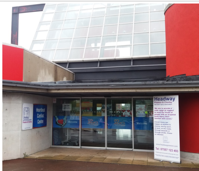
Heartbeat Centre, Sir Tom Finney Way, Preston PR1 6PA

Our new finance and legal surgery based at the Heartbeat Centre will be open from late summer 2016 and will be available to both Headway and Heartbeat members.